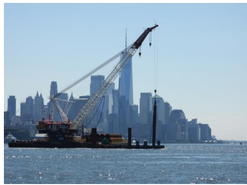
Floating construction barge in the Hudson River working on the HRGS Project

In line with GDC’s commitment to transparency and public engagement, the Commission last month installed an EarthCam at the Hudson Yards Concrete Casing – Section 3 (HYCC-3) site on Manhattan’s west side. Every day, a new panoramic image of the HYCC-3 construction site is available on the GDC website . A separate EarthCam has captured daily photos of the Tonnelle Avenue Project construction site since April.