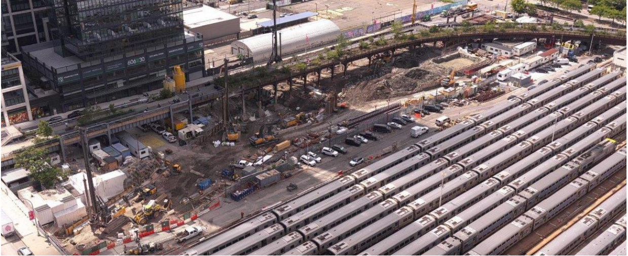
Recent photo of the HYCC-3 construction site. New panoramic photos are posted daily on the GDC website.