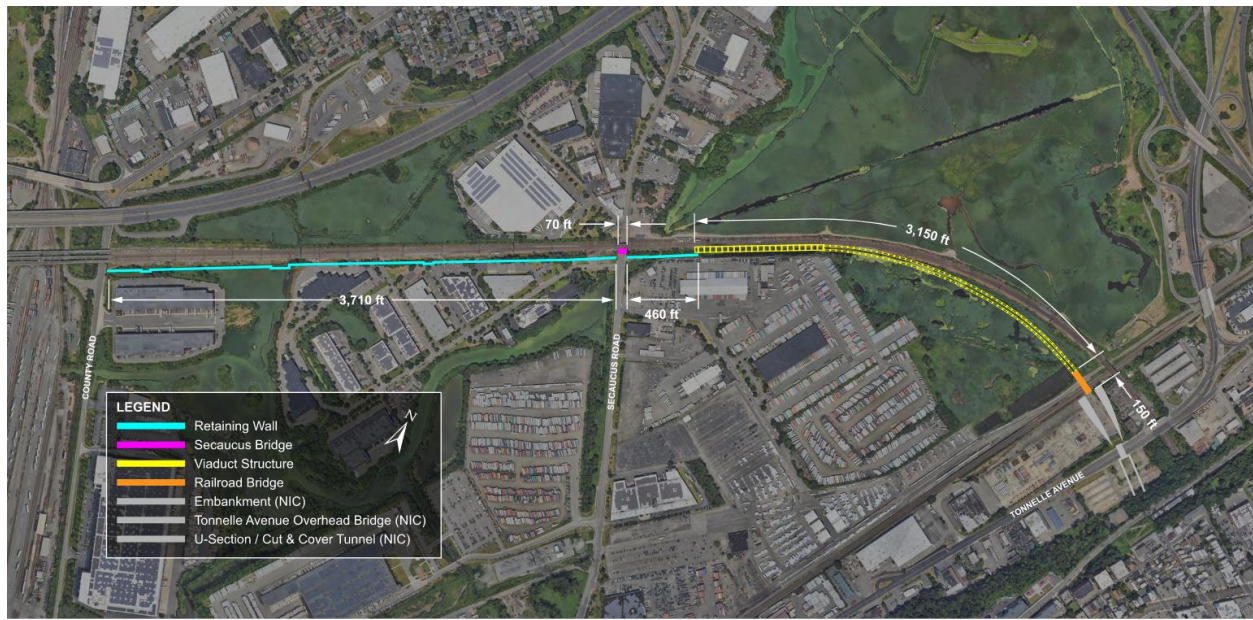
Figure 2: New Jersey Surface Alignment, Overview

A summary of right of way and easement constraints is attached as Appendix 1 . Detailed scope information is provided in Appendix 2 .