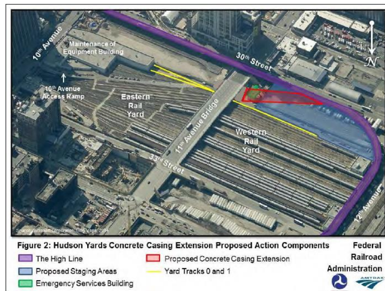
Figure 4: Location of the Hudson Yards Concrete Casing - Section 3

HYCC-3, located north of West 30 th Street between Eleventh and Twelfth Avenues, is the final phase of the right-of-way preservation project and is yet to be constructed (See Figure 4).