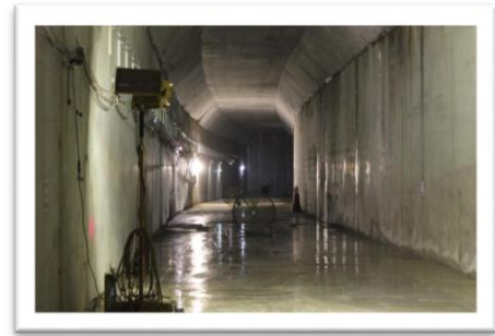
Figure 3: Completed Section of the Hudson Yards Concrete Casing

Separate and apart from the current EIS being prepared for the new Hudson River Tunnel and Rehabilitation of the Existing North River Tunnel, the construction of HYCC-3 was a component of a Supplemental Environmental Assessment (“SEA”) prepared by Amtrak in 2014. A Finding of No Significant Impact (“FONSI”) was issued by the FRA in 2014. HYCC-3 is a right-of-way preservation measure and is included in this RFI for funding and financing purposes.